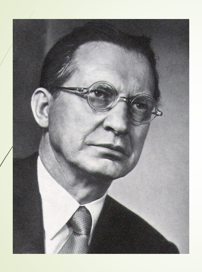
Alcide De Gasperi